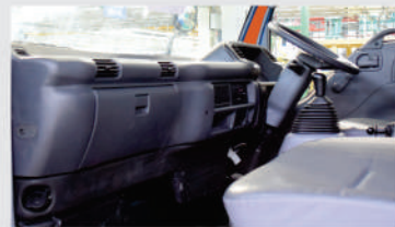
Clutter Free Dashboard with Smartly Placed Controls