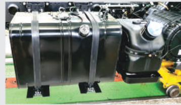
Newly Designed Fuel Tank along with Adblue Tank