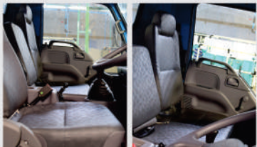
Comfortable, Adjustable Driver & Co-Driver Seats with Retractable Driver Seatbelt