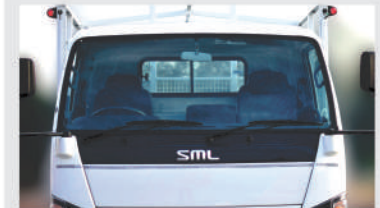
Large Front Windshield for Better Visibility