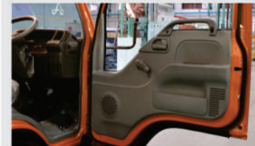
Wide Door Aperture (~90° Angle Approx) & Antiskid Footstep for Easy Inlet/Outlet