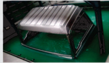
CED Coating for longer Paint Life And Superior Surface Finish