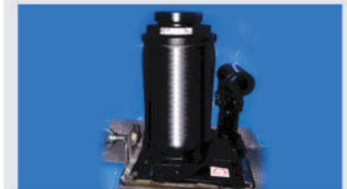
Hydraulic Jack for easy lift