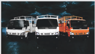
Stylish Looking Cabin with Global Appeal