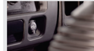
USB Port for Mobile Charging