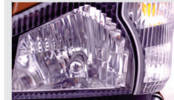
Crystal Clear headlamps for better Night time Driving