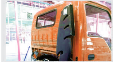
R.H.S. Vertical Air Cleaner for Better Air Filterations