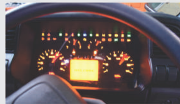
CAN Based Meter Cluster with Multi-Info Display